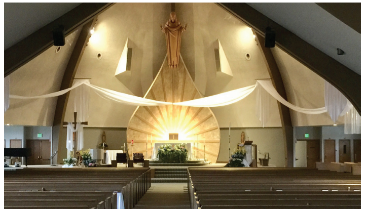
St. Francis Assisi Parish, Burien - Location of Pentecost Celebration 2018