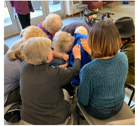
Small group prayer ministry was such a blessing!