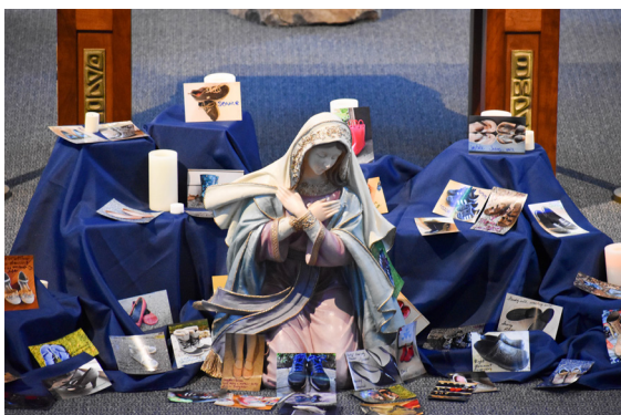
Friday evening in the chapel with the Blessed Mother and the shoe pictures

Equipped to walk with the Lord , a theme depicted in the Women's Retreat ad of a woman in walking sandals, was developed through photos of a variety of shoes, boots and sandals. The retreatants picked a photo and then explained why they chose that particular footwear. The photos were