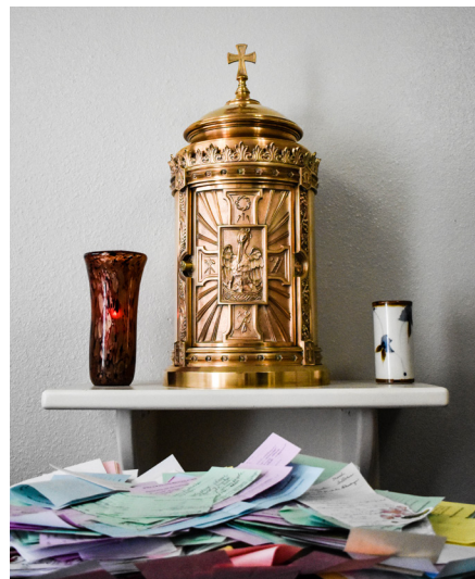
The WWCCR Chapel, where your mailed-in prayer intentions are prayed for and presented to the Lord.

saints to intercede for us, and in a special way, we ask the intercession of St. Joseph, protector of the Holy Family and patron of the universal Church. Throughout November and December, please pray to St. Joseph with us, using the suggested prayer on page 7.