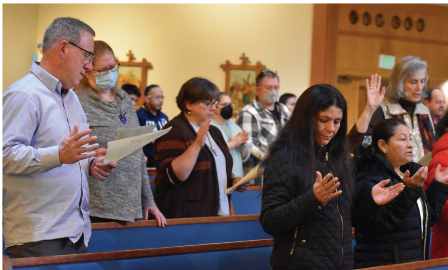
Praise and worship time